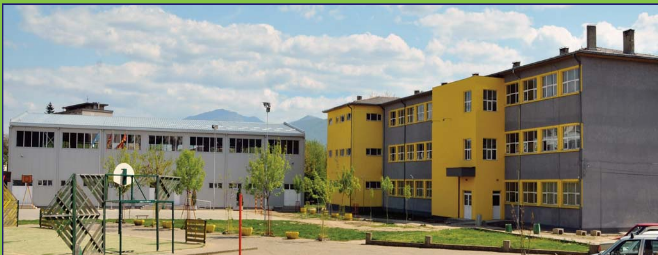
The renovated PS "Nikola Karev" from Kocani is one of the eleven schools renovated in 2013. The "Nikola Karev" school was completely renovated compared to its initial condition, thanks to the partnership between the IIEP, the Ministry of Education and Science, the Municipality of Kocani and the school.