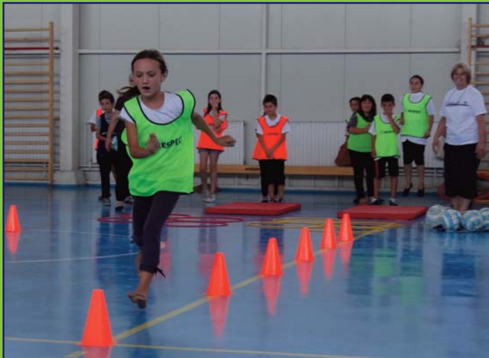
Joint sports and fun activities in the PS "Adem Jashari", Municipality of Cair

Contact us and share at: Kozle 1-b, 1000 Skopje, info@mcgo.org.mk