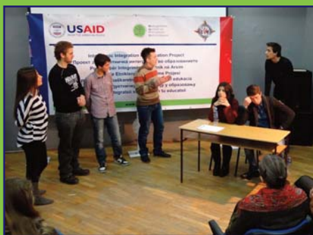
Forum Theatre workshop held with student representatives from all secondary schools in Tetovo. In these workshops, the students resolve a given situation through acting. This is one of the total of eight workshops held throughout Macedonia.