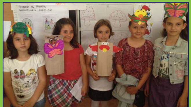
Integrated school event in the multilingual demonstration PS "Bratstvo Edinstvo" from Ohrid. Students from different languages of instruction work together on the preparation of creative products.