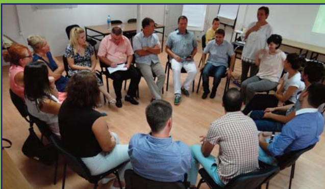
Training for team-work and coordination of the activities for the members of SIT-s in the primary demonstration schools, held in Skopje.