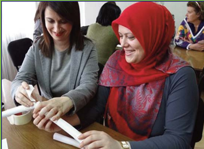
Creative participants at the training for demonstration schools held in Skopje