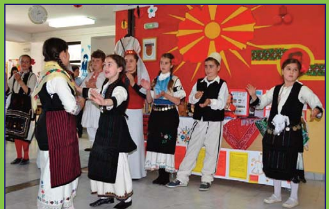
Partnership activities among two/three schools took place throughout the country. Children from PS "Krste P. Misirkov" from v. Bistrica, Bitola, PS "Kiril i Metodi" from Tetovo and PS "Aleksandar Turundziev" from Kukurecani, Bitola, through fun and games got to learn about each other's culture and make new friends.